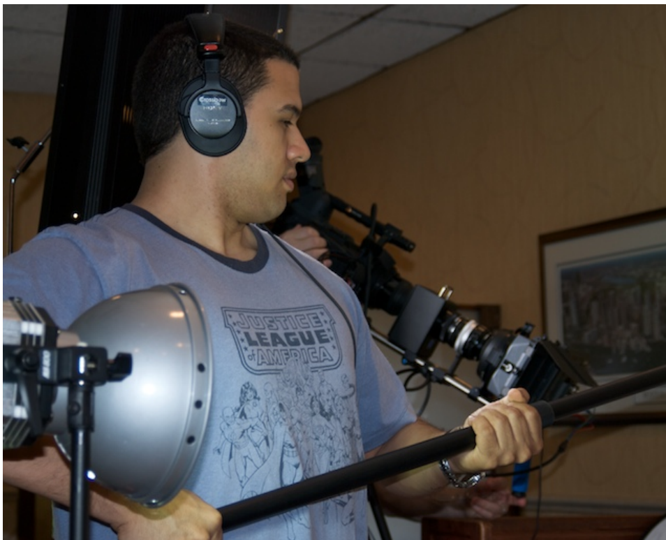
Location Sound & Key Grip Dan Armella